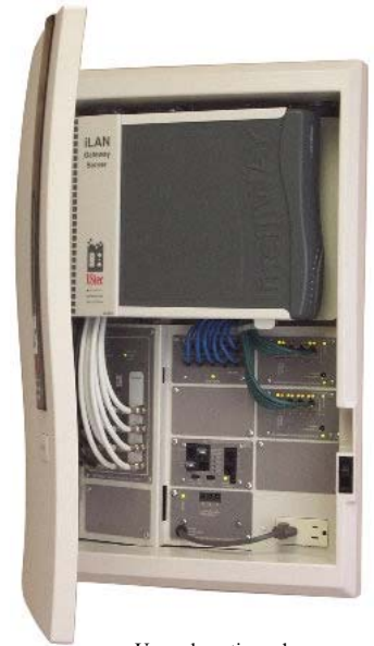
Upgrade options shown